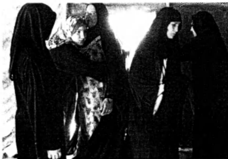
Des femmes chiites en pèlerinage vers Kerbala sont fouillées par des policières irakiennes, vendredi 15 août, à Latifiya.

A Kerbala, 40 000 soldats et policiers irakiens sont mobilisés pour accueillir les pèlerins qui affluent d'Irak, d'Iran, mais aussi de plusieurs pays musulmans d'Asie. Parmi eux figurent 2 000 femmes ayant pour mission de fouiller les éven-