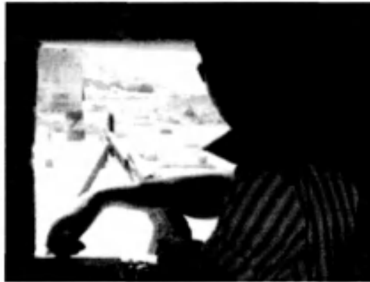
A Christian civilian guard secures a gate leading into the Kramalis village.