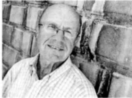
İsmail Beşikçi, the most authoritative academic expert on Turkey's Kurds, is also an icon for freedom of speech, as he was the only person from a non-Kurdish ethnic background to passionately defend Kurds' rights.

When Today's Zaman arranged a third meeting with Beşikçi to photograph him, he was quite patient with the newspaper's photojournalist, who wanted to take a lot of photographs from different angles. Yet, once more surprising us with his strikingly innocent naïveté and sense of humor, smiling to the camera, Beşikçi said "Edi bese!" ("Enough is enough" in Kurdish). Then it was noticed that one of his hands was marked with henna. When asked, he said he had attended a Kurdish wedding near a village in the district of Cihanbeyli in Konya over the weekend and