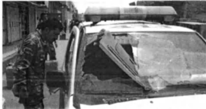
A policeman inspects damage to a police truck following a roadside bomb attack last month in Kirkuk. The oil-rich city's status has become one of Iraq's most urgent political issues.

The confrontation in Kirkuk comes down to who will control the city and the surrounding oil fields, which contain 40% of Iraq's massive reserves of crude. Nearly every ethnic and religious group in Iraq is present here — the city of about 850,000 has been called "Iraq's Jerusalem" — meaning an eruption of sectarian violence in Kirkuk