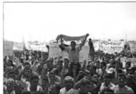
People attend a protest in the town of Hawija, Iraq, Saturday, Aug. 2, 2008. More than 1,000 Sunni Arabs and Turkmen staged a demonstration Saturday to protest calls by Kurds to annex the oil-rich city of Kirkuk to their autonomous region as Iraqi officials met in Baghdad to defuse tension over the disputed city.

On Sunday, President Bush telephoned Iraq's Shiite vice president, Adel Abdul Mahdi,