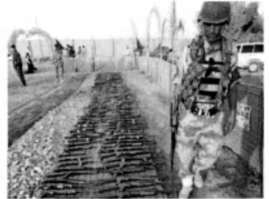
An Iraqi soldier inspects weapons which were found during military search operations in different parts of Diyala province.