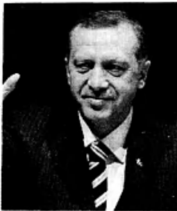
Le premier ministre Erdogan doit désormais ménager la susceptibilité du camp kémaliste et relancer le processus des réformes, attendu par la frange libérale de la population.